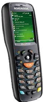
Fig. 1: Sample PDA

PrintLab's flexibility also is frequently used by POS or hosting systems in two situations. First, it can be used with handheld devices (FM units) that create tag requests using their handheld device. This request can then be printed. Alternatively, the customer may complement this data with data contained in the Data Compliment Module (optional item).