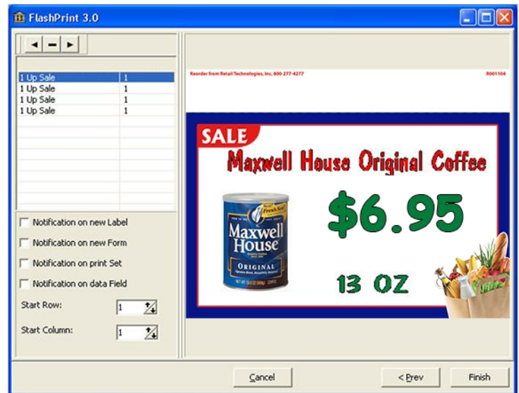
Figure 2: Print Screen

The bottom left pane displays a list of print control options. "Start Row" and "Start Column" are useful when sending a sheet of shelf-talkers or labels back through the printer to reduce material waste. The Notification of Label, Form, Set, and Data Field are used to prompt the operator of the need to change stock types and other types of user interaction in the printing process.