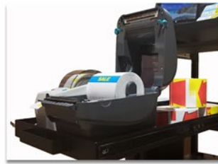
Optional slide-out keyboard tray, printer tray and scanner holder