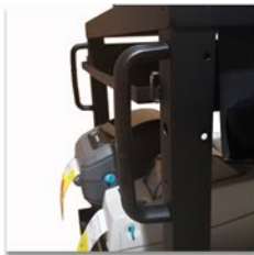
Integrated push handles for easy maneuverability