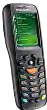
Fig. 1: Sample PDA

PrintLab's flexibility also is frequently used by POS or hosting systems in two situations. First, it can be used with handheld devices (FM units) that create tag requests using their handheld device. This request can then be printed. Alternatively, the customer may complement this data with data contained in the Data Compliment Module (optional item).