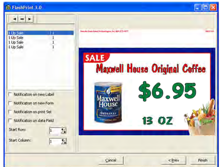
Figure 2: Print Screen

The bottom left pane displays a list of print control options. "Start Row" and "Start Column" are useful when sending a sheet of shelf-talkers or labels back through the printer to reduce material waste. The Notification of Label, Form, Set, and Data Field are used to prompt the operator of the need to change stock types and other types of user interaction in the printing process.